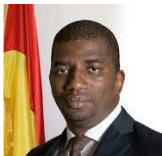
Abdoulaye Magassouba Minister of Mines and Geology Republic of Guinea